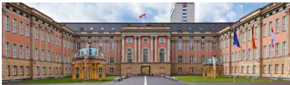
The public inner courtyard

Castle by Cologne artist Florian Dombois who won the first prize of the 2011 Percent-for-Art-Contest (Wettbewerb “Kunst am Bau”). 9 The inner courtyard which is surrounded by magnificent façades in keeping with the original appearance thus remains largely free of any structural impediments. The inner courtyard open to the public, the sweeping entrance area and the roof terrace emphatically underline the Landtag building’s claim to be an open house for all citizens.