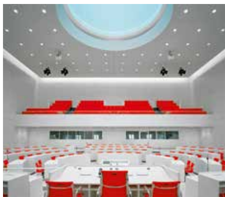
View of the visitor gallery from the plenary chamber in January 2014

The stables were connected to the City Palace by the Wrestlers' Colonnade. This colonnade was erected in 1746 to a design of von Knobelsdorff, and originally consisted of 14 pairs of pillars that served as an open, clearly-demarcated pedestrian route set apart from the area of the pleasure gardens. The colonnade got its name from the eight groups of wrestlers and fencers created by famous Potsdam sculptors and erected between pairs of pillars.