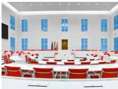
The lectern in the plenary chamber since August 2014

The third floor is home to additional offices of the AfD parliamentary group as well as those of the BVB/FREIE WÄHLER parliamentary group .