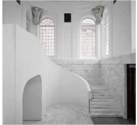
The Knobelsdorff Staircase in the new Landtag building

Another reason for the decision was the safety concerns voiced over installing the remaining sections of the original balustrade. By contrast, even at the advanced stage it still proved possible to reinstate the historical vaulted ceiling.