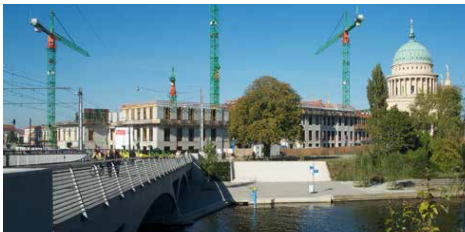
View of the construction site for the new Landtag building

The President praised the work of the architect who, he said, had succeeded in implementing the compromise solution of erecting a modern Landtag in a historical shell in a masterly fashion.