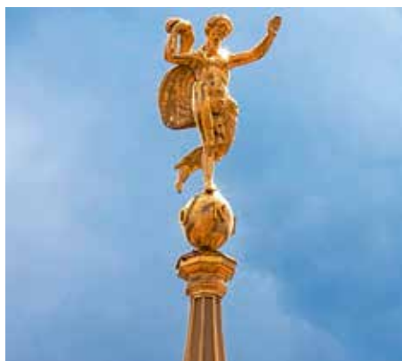
The Fortuna once again highlighted against the Potsdam sky

tember 2000 and the official inauguration took place on 12 October 2002.