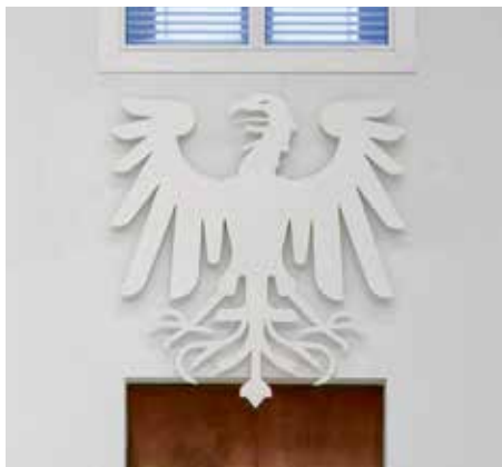
Presentation of the white eagle originally installed in the Plenary Chamber

caused by the decision of the Landtag Arts and Amenities Commission to follow the architect's suggestion of mounting a white eagle in the plenary chamber rather than a red one as is the emblem of the Land of Brandenburg. While the CDU parliamentary group tabled the motion at the Plenary to have the white eagle then installed above the bronze door replaced by the state coat of arms, the majority resolved on 15 May 2014, at the request of the government supporting coalition and after consulting the architect, to take down the white eagle and install a red one with the lettering "Landtag Brandenburg" on the lectern. 7