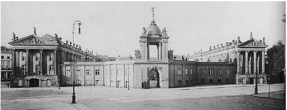
The historic Potsdam City Palace

In 1740, Frederick II became King of Prussia. He used Charlottenburg Palace as his residence during his first years in office.