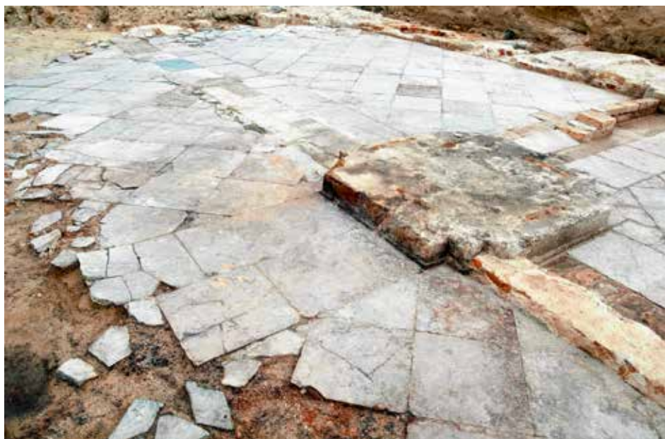
Saved by archaeologists: 500 square metres of stone floor from the dining hall of the great Elector dating back to the 17th century. An “archaeological window” in the new Landtag building provides a view of its historic heritage.