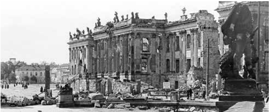
The destroyed Potsdam City Palace

The "Yellow Saloon", the living room of Queen Luise, was reconstructed in 1932 and reopened to the public at Whitsuntide 1932. The museum remained in operation until 1941.