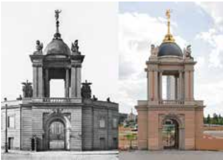
Comparison of the original Fortuna Gate and the replica made in 2002

Although Charlottenburg Palace remained the royal residence after the change of government, even after his marriage to Princess Luise of Mecklenburg-Strelitz, Frederick William III still kept an apartment in the City Palace, which was the object of numerous alterations after 1799. The couple enjoyed staying there until Luise's death in 1810.