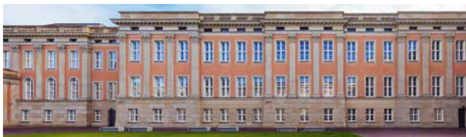
The east wing façade viewed from the inner courtyard