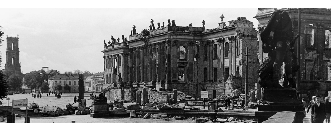
The destroyed Potsdam City Palace.

The City Palace burnt down to the enclosing walls following a British air raid on the city on 14 April 1945. As only few of the sumptuous interior fittings had been removed to air raid shelters or other buildings for safekeeping, most furnishings left in the Palace were irretrievably lost in the ensuing fire. The exterior façade of the Palace also suffered severe damage during the raid. High-explosive bombs left a trail of destruction through the West Wing and virtually destroyed the "Fortunaportal"