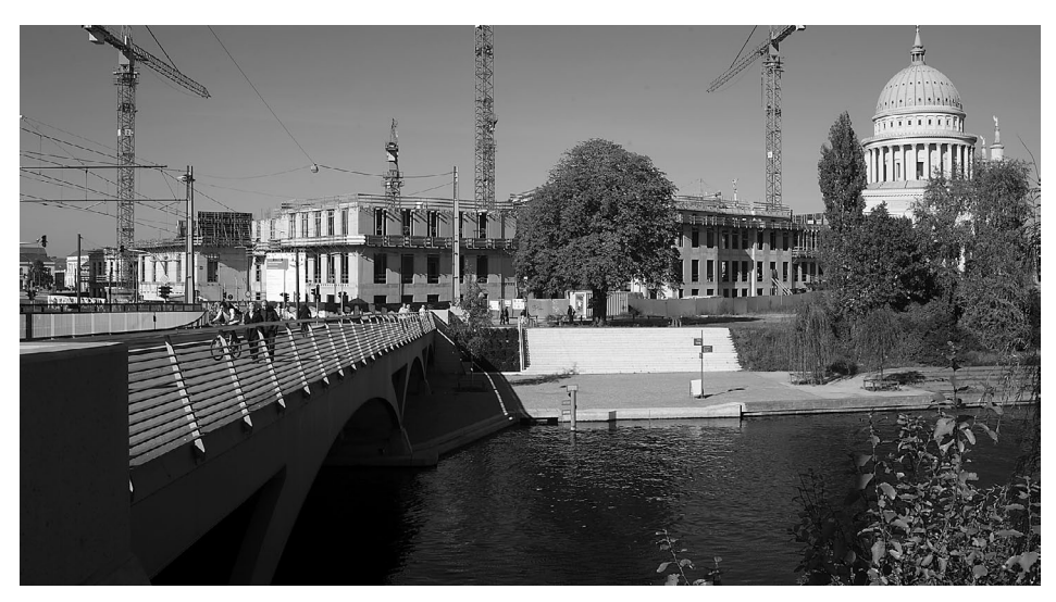
View of the construction site for the new Landtag building.

Foundations of the castle and palace complex over an area of around 3,000 m<sup>2</sup> below the new Landtag building and in the inner courtyard have remained intact. Landtag President Gunter Fritsch, Minister President Matthias Platzeck, Finance