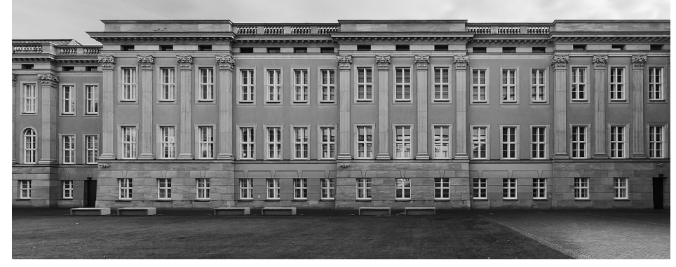
The east wing facade viewed from the inner courtyard.