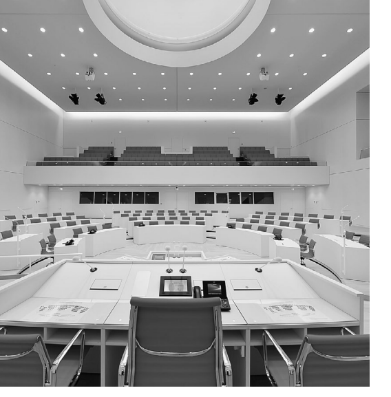
View of the visitor gallery from the chair.

Approximately half of the length of the Wrestlers' Colonnade was destroyed in the British air raid on Potsdam. After the demolition of the City Palace ruins. the preserved section was moved a few hundred metres from its original spot, near today's "Mercure" hotel. It now stands on the edge of the New Pleasure Garden (Neuer Lustgarten) alongside the "Neptunbecken" (Neptune Basin) near the landing pier of the White Fleet.