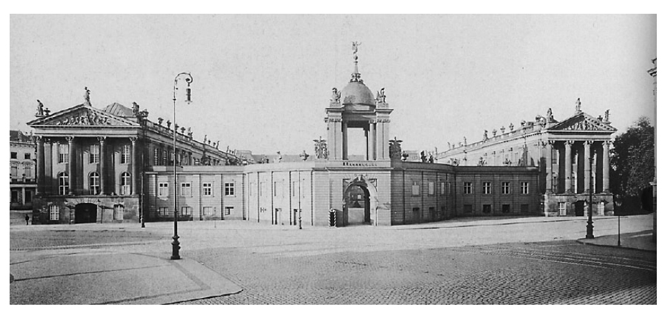
The historic Potsdam City Palace.

Given the extremely perilous state of the finances left behind by his predecessor, the Soldier King decided to sell as many of his palaces as possible and keep only a few. The Potsdam City Palace was one of the few to remain in the king's possession. In contrast to Charlottenburg Palace, however, it was used as a family residence rather than on state business. The vaulted basement was converted into a wine cellar in 1726. Only minor repairs were undertaken to the rest of the Palace while Potsdam was converted to a garrison city instead. As the city expanded, the regular division into districts resulted in a distinct chessboard pattern and followed the lines of the main arteries from the time of the Great Elector running towards the Palace. Urban development thus centred entirely on the Palace whose location between the town centre in the north and the Havel River in the south turned it into an important landmark visible from all directions.