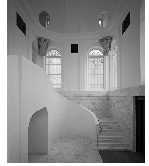
The Knobelsdorff Staircase in the new Landtag building.

On the ground floor of the main building , the southern section of the Landtag lobby contains the exhibition area, cafeteria, cloakroom as well as rooms