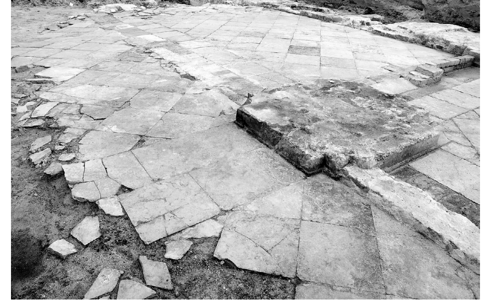
Saved by archaeologists: 500 square metres of stone floor from the dining hall of the Great Elector dating back to the 17th century. An "archaeological window" in the new Landtag building provides a view of its historic heritage.