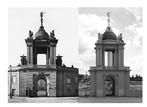
Comparison of the original Fortuna Gate and the replica made in 2002.

The Great Flector issued the "Potsdamer Toleranzedikt" (Edict of Potsdam) from the City Palace in 1685: he invited Protestant Huguenots then persecuted in France on religious grounds to live in Brandenburg in freedom and