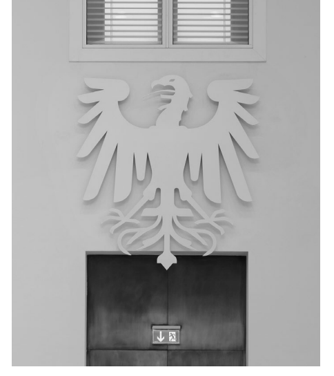
Presentation of the white eagle originally installed in the Plenary Chamber.

of arms, the majority resolved on 15 May 2014, at the request of the government supporting coalition and after consulting the architect, to take down the white eagle and install a red one with the lettering Landtag Brandenburg on the lectern.8