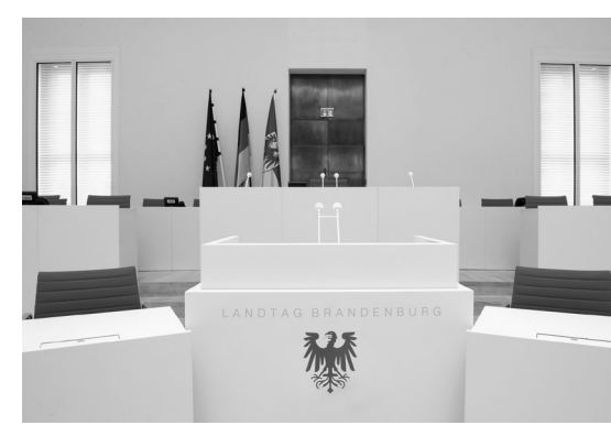
The lectern in the plenary chamber since August 2014.

The main co-user of the third floor premises is the State Audit Office.