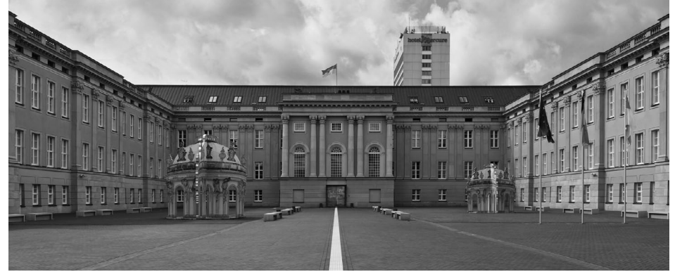
The public inner courtyard.

ing with the original appearance thus remains largely free of any structural impediments.